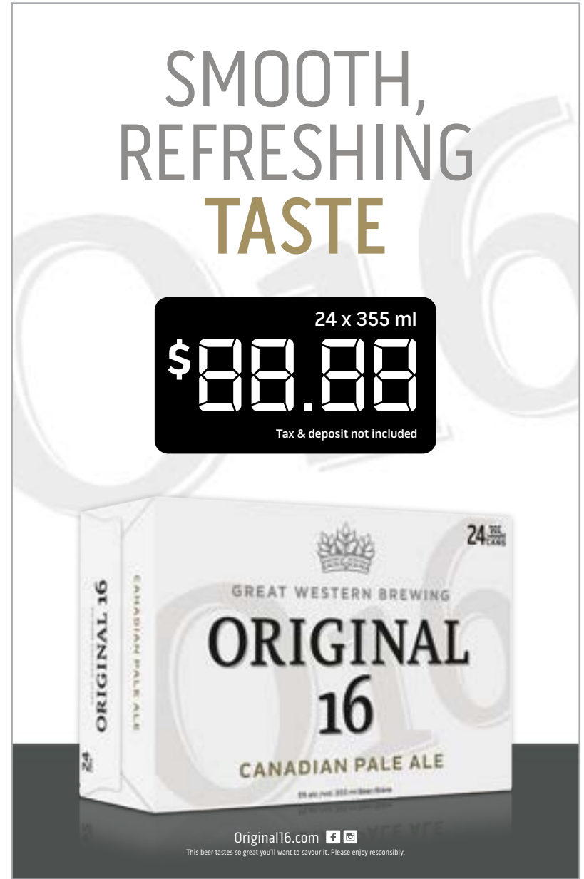
11 x 17