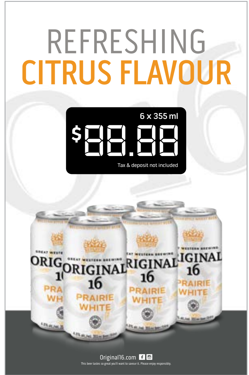
11 x 17