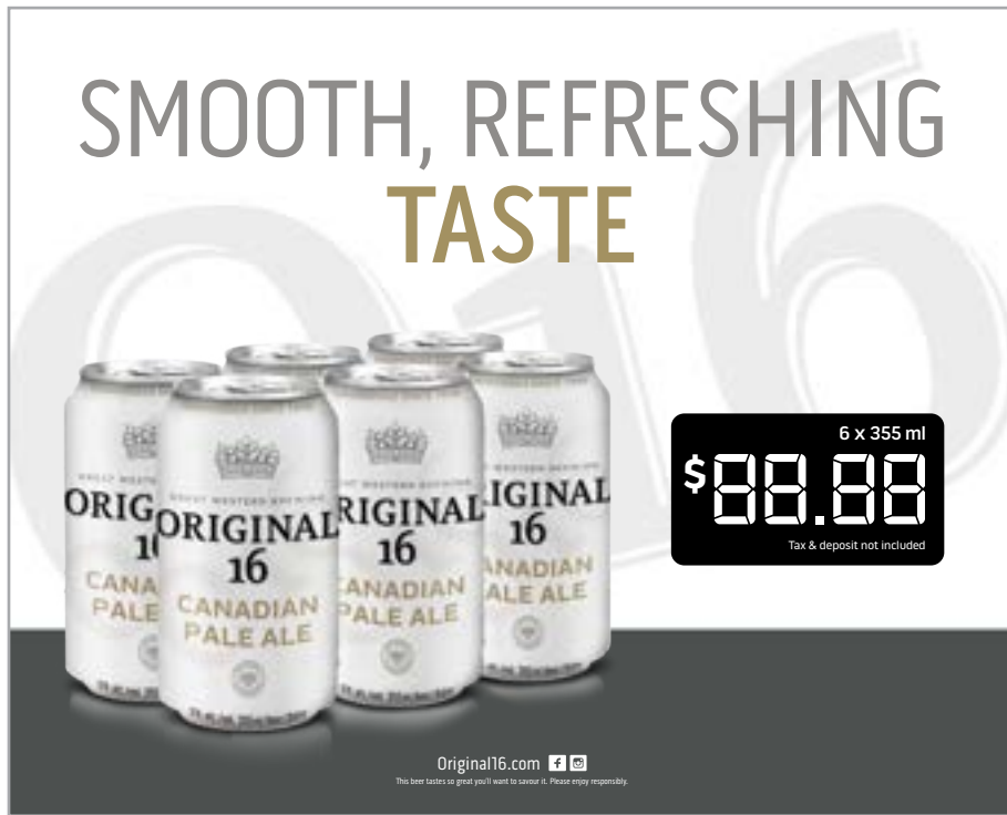
30 x 24