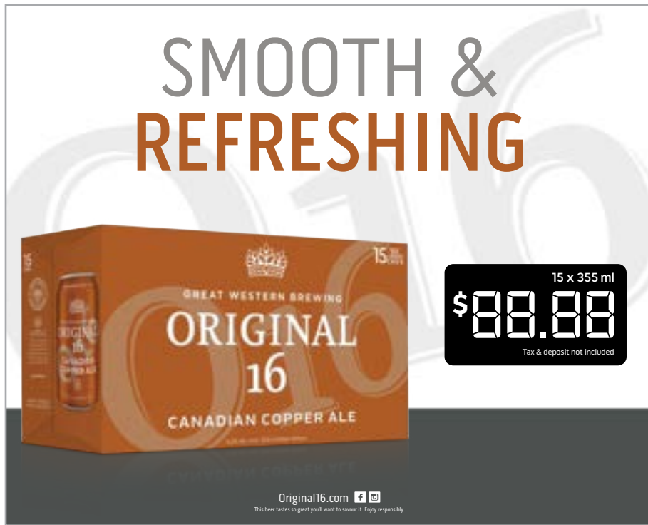
30 x 24