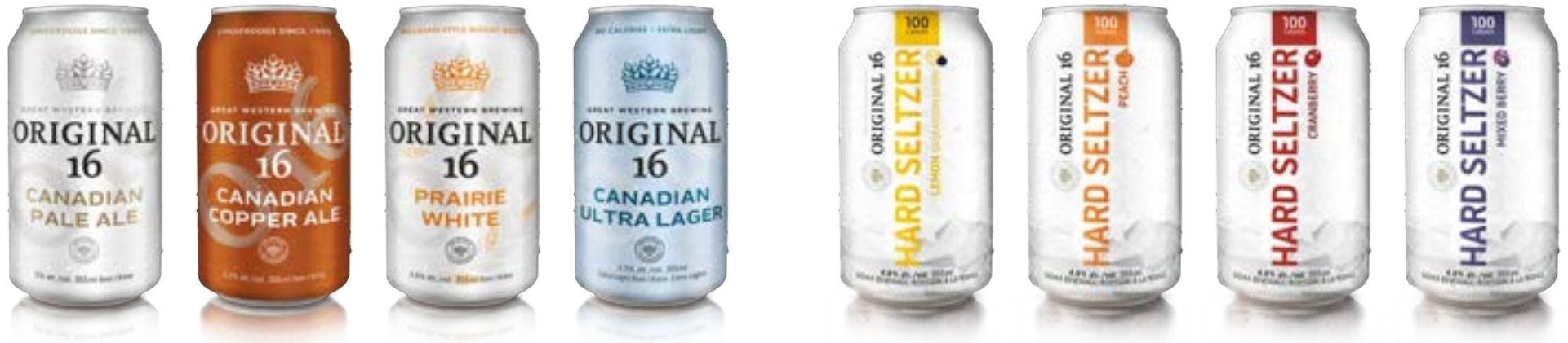
Family of Beers